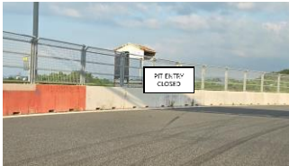
PIT ENTRY CLOSED SIGNBOARD