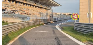
PIT LANE STARTS (WHITE LINE)